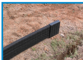
6" & 12" END CAP (10/box)