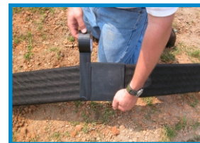
6" & 12" SPLICE (10/box)