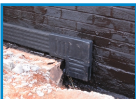
6" ONLY STEP DOWN (10/box)