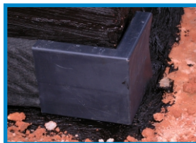
6" & 12" CORNER (10/box)