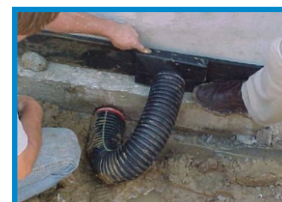
6" & 12" SIDE OUTLET (10/box)