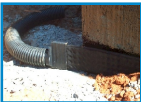
6" & 12" END OUTLET (10/box)