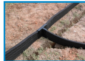
6" ONLY T-CONNECTOR (10/box)